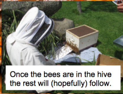
Once the bees are in the hive the rest will (hopefully) follow.