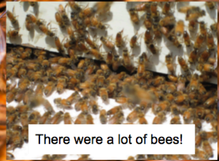
There were a lot of bees!