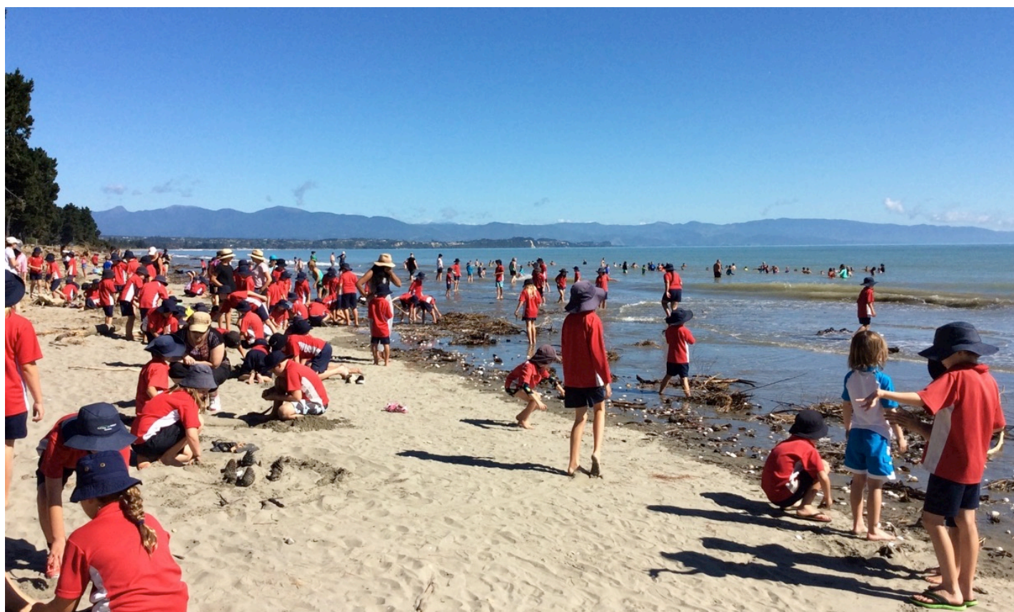
A sunny day in paradise!